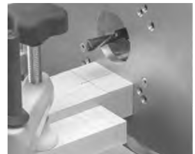
FIGURE 3. Calibrate stock to template by aligning centerline of stock to centerline of vertical table.