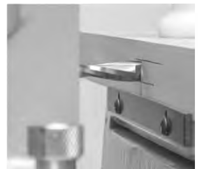
FIGURE 4. Adjust depth of cut by adjusting the router.