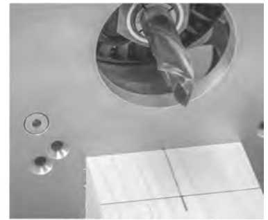
FIGURE 1. Carefully lay out the centerline of your stock and the depth of the tenon cut.