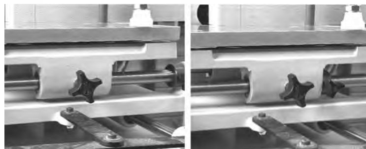
FIGURES 12. Lock the stops in place to limit the travel of the horizontal table.