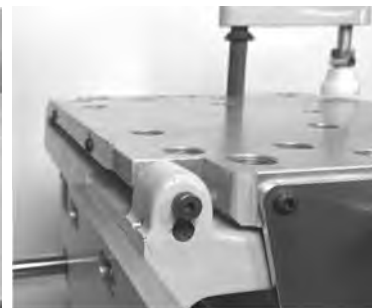
FIGURE 9. The front fence can be raised to reference your stock square to the vertical table.

9. Locate and mark the centerline of the mortise on your workpiece as well as desired mortise depth.