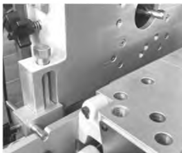
FIGURE 8. Center the horizontal and vertical table by placing the stylus in the notch on the template holder.