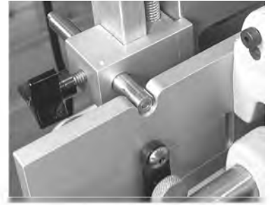
FIGURE 2. Center the horizontal and vertical table by placing the stylus in the notch on the template holder.