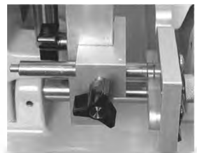
FIGURE 5. Stylus is adjusted to top of template once cutter is adjusted to tenon shoulder. Bring Stylus forward to template, then back off slightly.