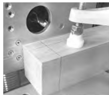
FIGURE 10. Calibrate stock to template by aligning the centerline of stock to centerline of vertical and/or horizontal table.

15. Lower the vertical table and insert the reduced pin on the MT Stylus into the slot on the MT Template. Tighten the "Z"-Axis Table Lock and Stylus Lateral Lock.