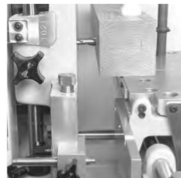
FIGURE 13. Set the vertical table to the desired position for your mortise for your mortise and lock the Z-Axis Table Lock.

• If you purchased a cased set of the MT Combo Templates, a space within the foam is available to store your Variable Stylus and extra bushings when not in use.