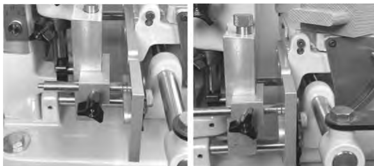
FIGURES 6 & 7. After most of the material is machined away, hold Stylus tight to Template and work all the way around the Template.

26. Holding light consistent pressure against the template with the "Y" and "Z" Axis handles, go completely around the tenon in a clockwise direction once or twice. FIGURES 6 & 7.