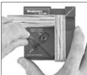
Fixture clamping mode.