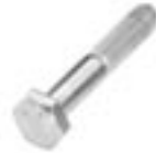
1/4-20 x 1-1/2" Hex Bolt