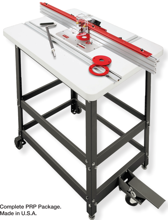
Complete PRP Package. Made in U.S.A.

This package also includes our powder coated 14 gauge steel Router Table Stand which supports the table with six braces and is vertically adjustable from 36" to 42". The Wheel Kit allows for easy mobility with a simple push of a foot pedal.